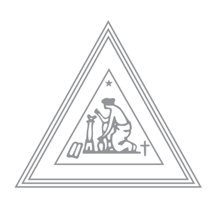
DOANE UNIVERSITY Spring Commencement 2023